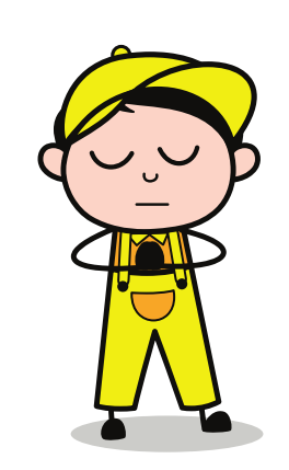
I can do this!