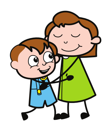
I am loved