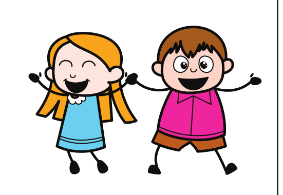
I am a good friend