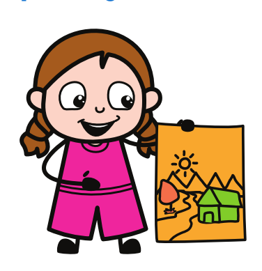
I can do whatever I put my mind to!