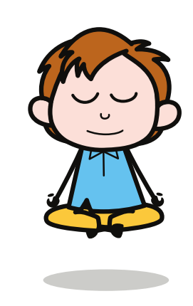
I am resilient